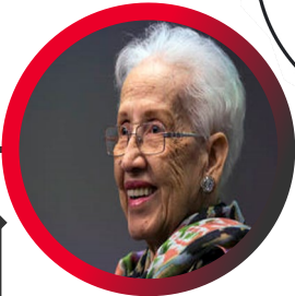
Katherine Johnson Mathematician

Inquiries for the event should be sent to bignsfprogramandplans@nsf.gov .