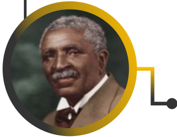
George Washington Carver Agricultural Chemist