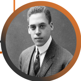
Ernest Everett Just Biologist

If you require technology assistance or reasonable accommodations to participate in this event, please send an email to rarequest@nsf.gov at least 72 hours/3 business days in advance.