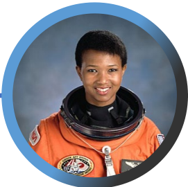
Mae Jemison Engineer