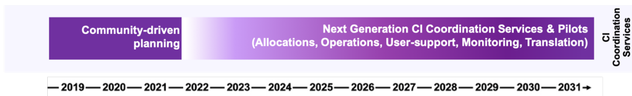
Figure 2. Notional execution timeline for the national CI coordination services blueprint.

CI coordination services (contingent as always on budgets and national priorities) over the lifetimes of the NSF-funded computational ecosystem to ensure its effective and efficient use.