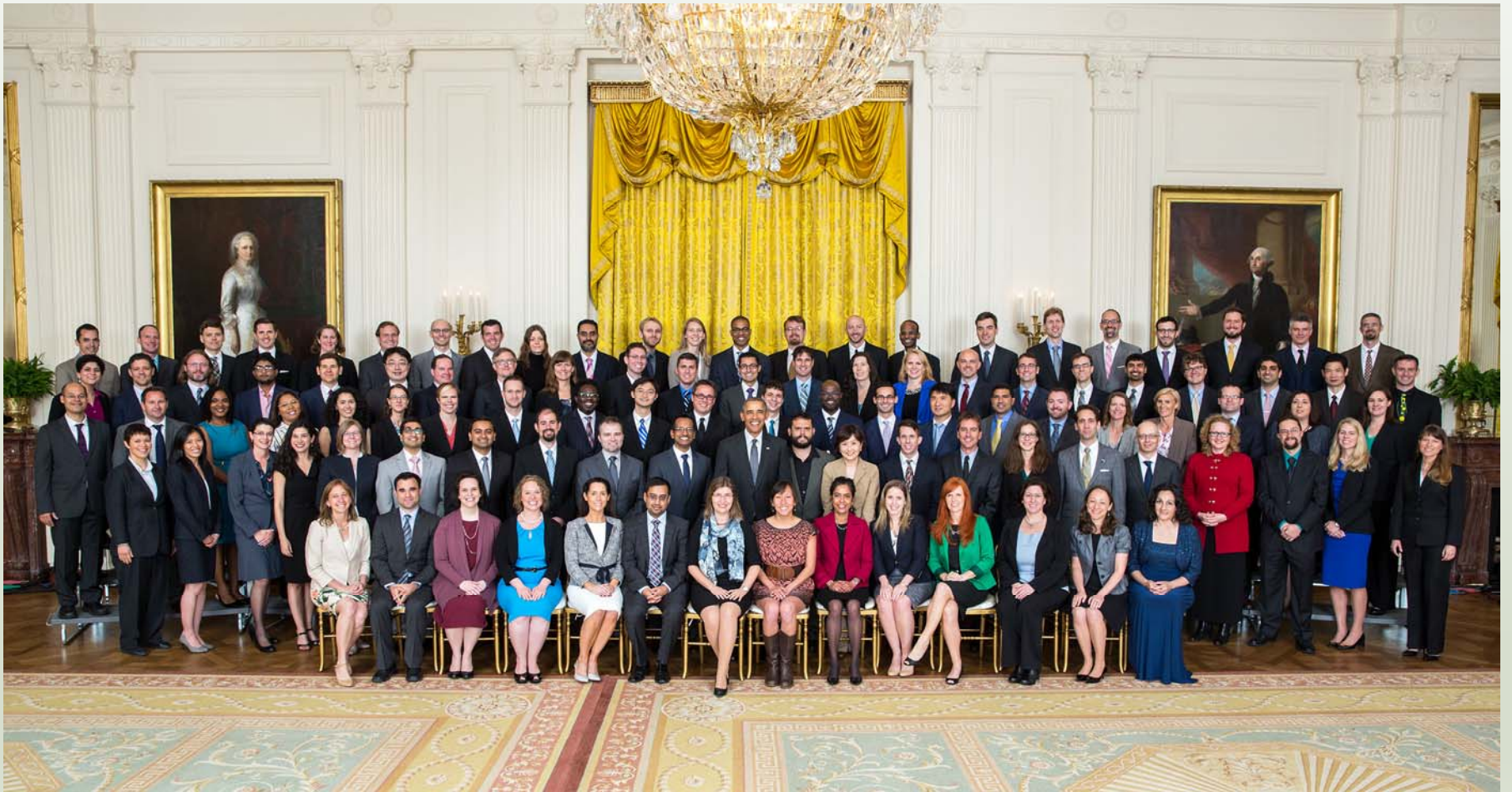
May 2016