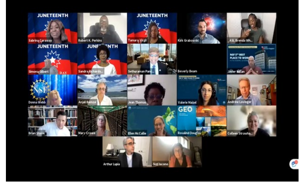
BIG ERG Co-sponsored Program