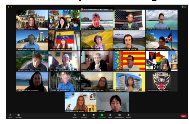
Los Amigos ERG Meeting