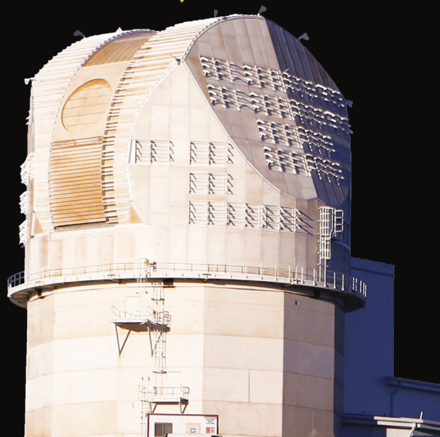
NSF's Daniel K. Inouye Solar Telescope