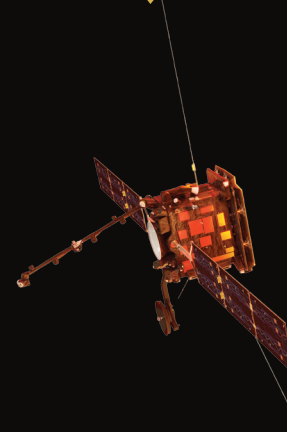
ESA/NASA Solar Orbiter